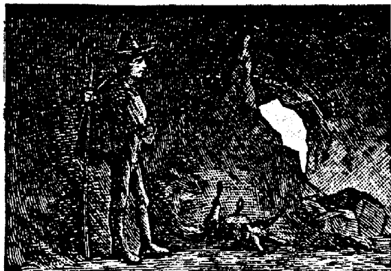
Paul Bert's (1886) version of the guide at the grotto and his recumbent dog (9).

skeletons of human beings, animals, and birds which have been asphyxiated in an atmosphere overloaded with carbon dioxide.