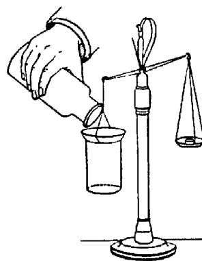
Illustrating the mass of carbon dioxide by pouring it downhill (11)