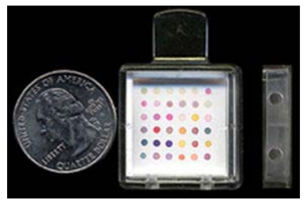
SPOT ON. The dabs of dye on this coin-size sensor change color in response to odors.