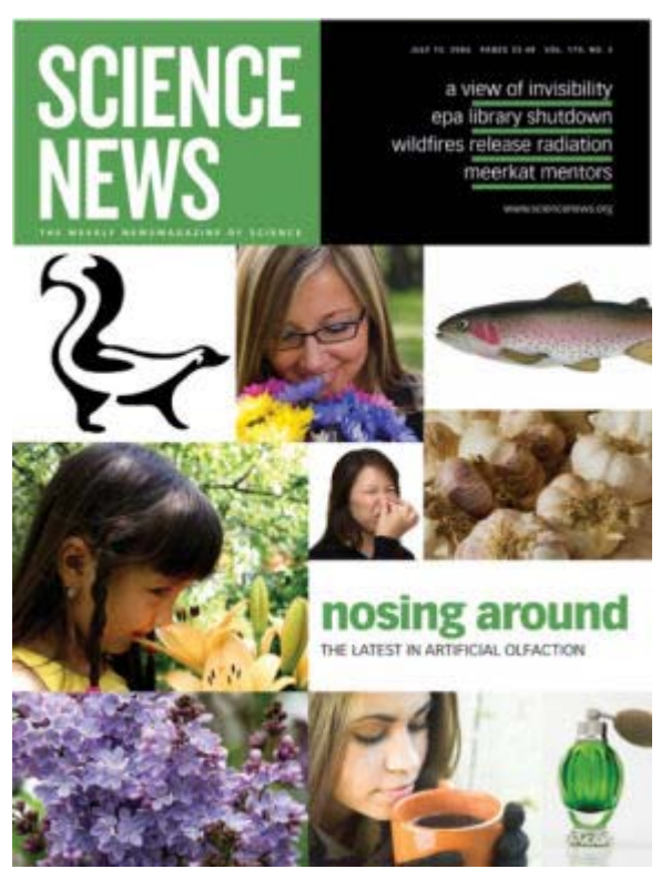
Fresh coffee in the morning, a flower on a spring day—every aroma provokes a patterned olfactory response that the brain interprets. Researchers have created different types of pattern-based chemical-sensing systems that take cues from mammalian olfaction and taste.

The latest generation of artificial olfactory and gustatory systems uses a variety of binding interactions to produce optical cues, such as changes in color or fluorescence, some of which can be seen with the naked eye. One of the new systems can even discriminate between molecules that have mirror image structures.