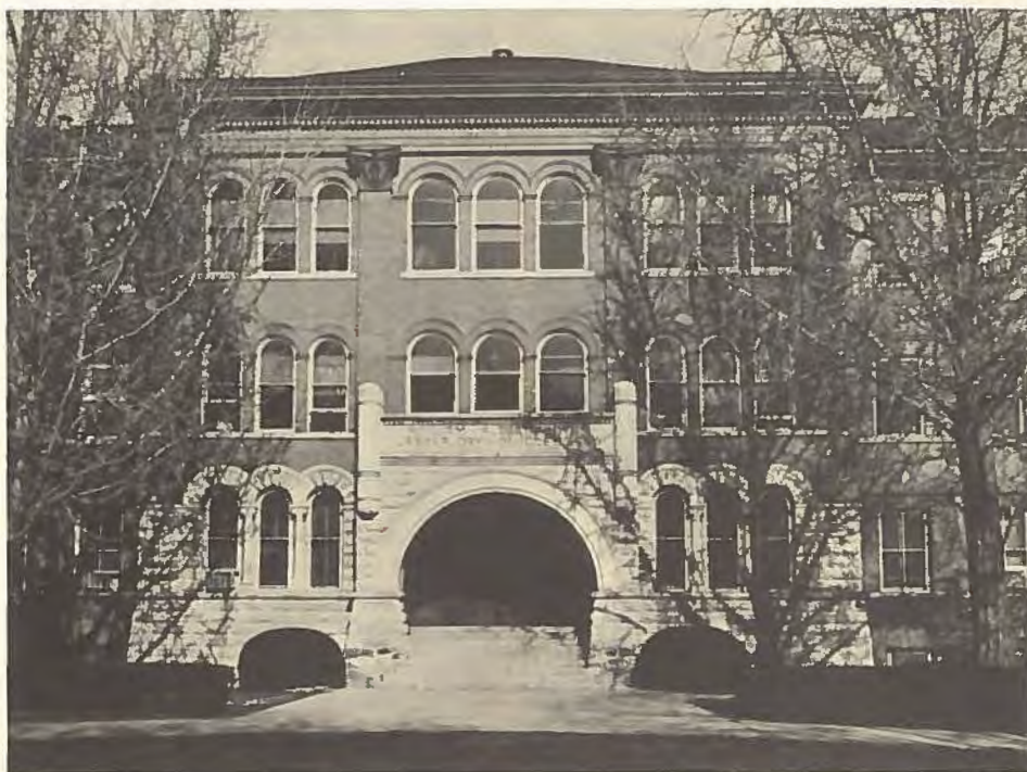
William Albert Noyes Laboratory of Chemistry, Urbana, Illinois

Since there has been a lapse of several years in the publication of the SCS Alumni Newsletter , much of the news is not current but reflects some of the events since 1981 in the School of Chemical Sciences. Consequently, this is a bumper issue. We plan to publish the newsletter twice a year and, for next time, would very much like to have news of your professional life and affiliation. Please keep in touch.