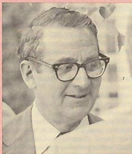
Professor E. J. Corey

The University of Illinois awarded an honorary degree this summer to one of its most prestigious former faculty, Elias J. Corey, professor of chemistry at Harvard University, and one of today's leading figures in synthetic organic chemistry.