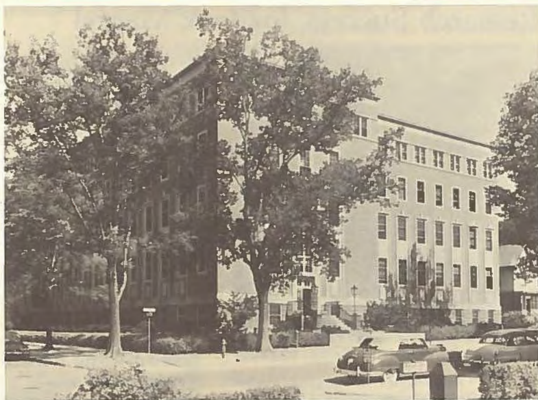
Roger Adams Laboratory in the 1950s.