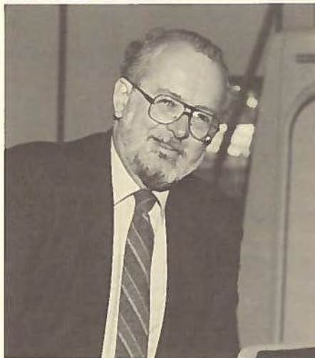
Professor Paul C. Lauterbur

Paul Lauterbur, professor of chemistry at the State University of New York at Stonybrook, joins the Illinois chemistry faculty this fall.