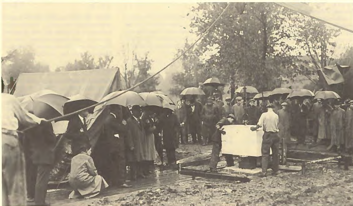
Laying the cornerstone for the East Chemistry Building, 1946

SCS Alumni Newsletter School of Chemical Sciences University of Illinois at Urbana-Champaign 106 Noyes Laboratory 505 South Mathews Ave. Urbana, Illinois 61801