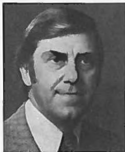
John R. Huizenga